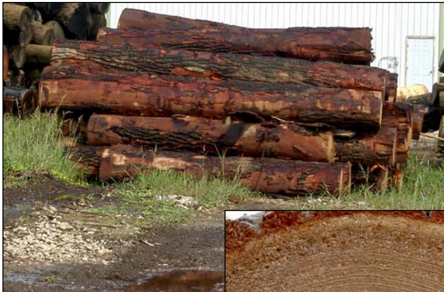
Small pile of sassafras logs showing cinnamon red color