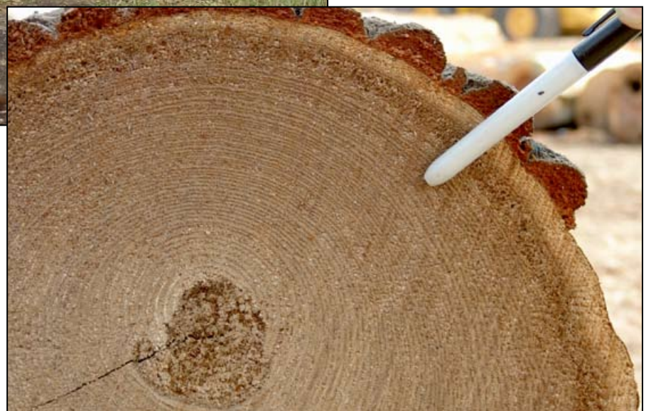
Log end showing a light brown heartwood, very narrow sapwood, and cinnamon red bark